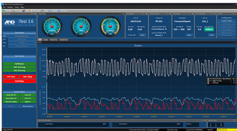
AutomationPanel provides a powerful graphical user interface for run-time control and reconfiguration.