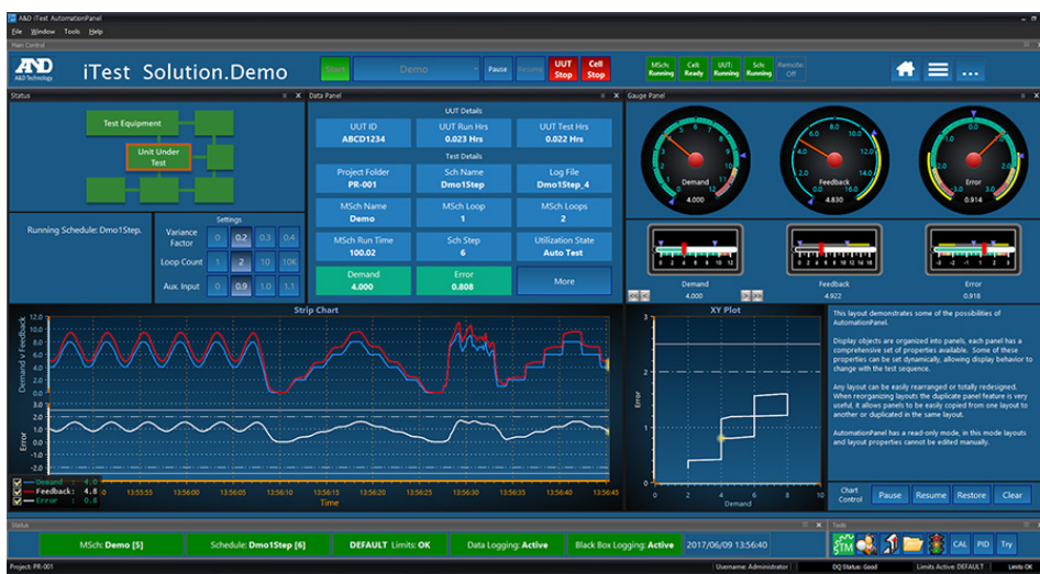
AutomationPanel provides a powerful graphical user interface for run-time control and reconfiguration.